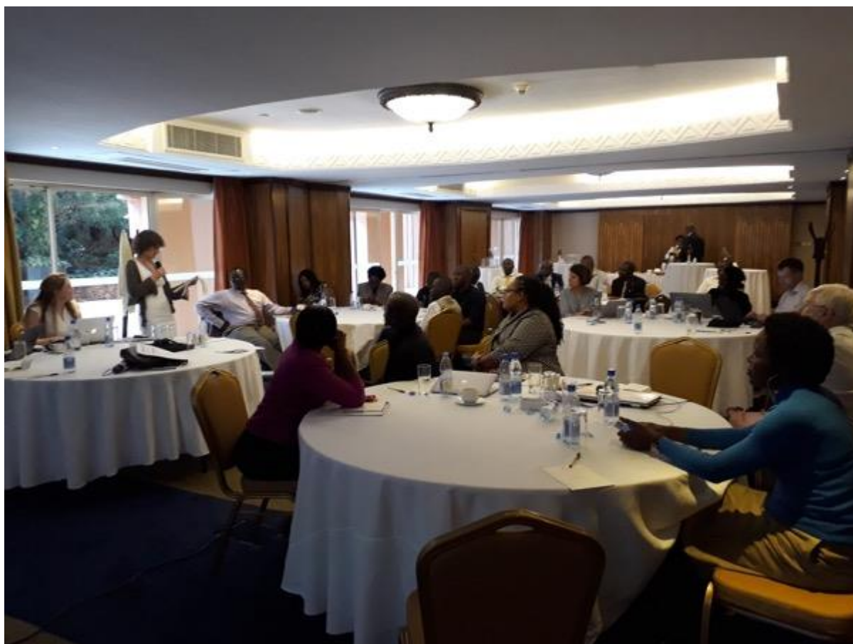
Figure 1: Attendees at the Natural Capital workshop