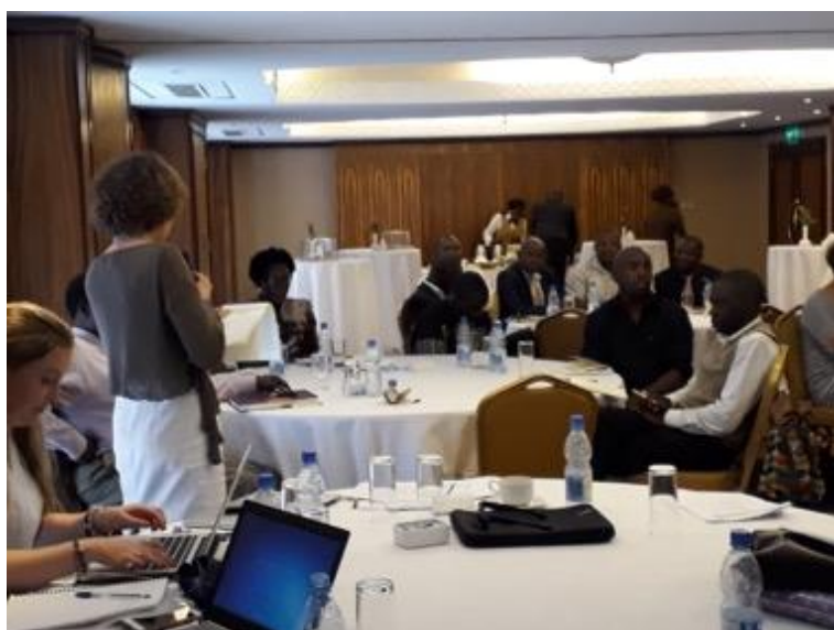
Figure 4: Feedback on discussions held during the workshop